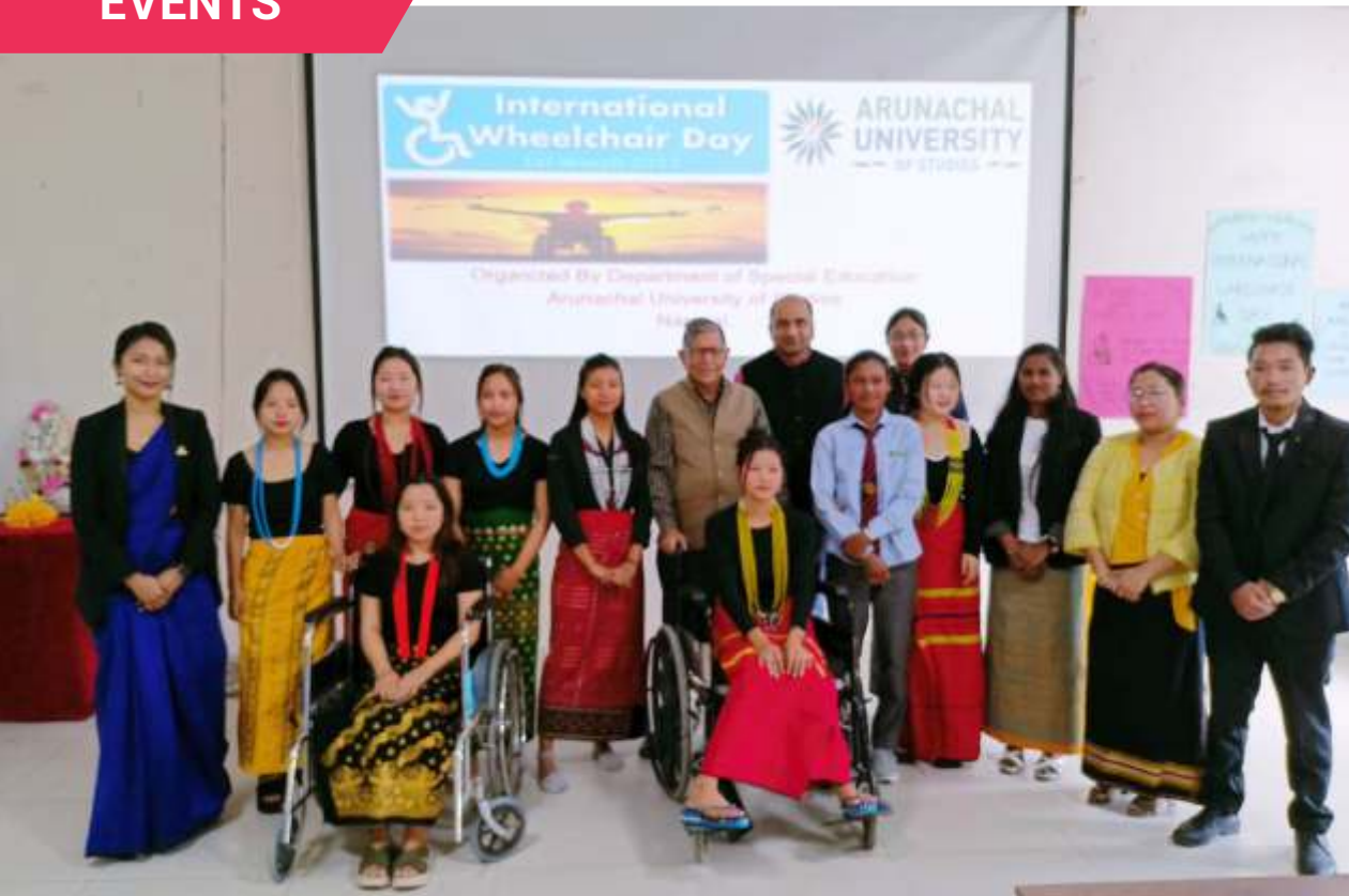
International Wheelchair Day