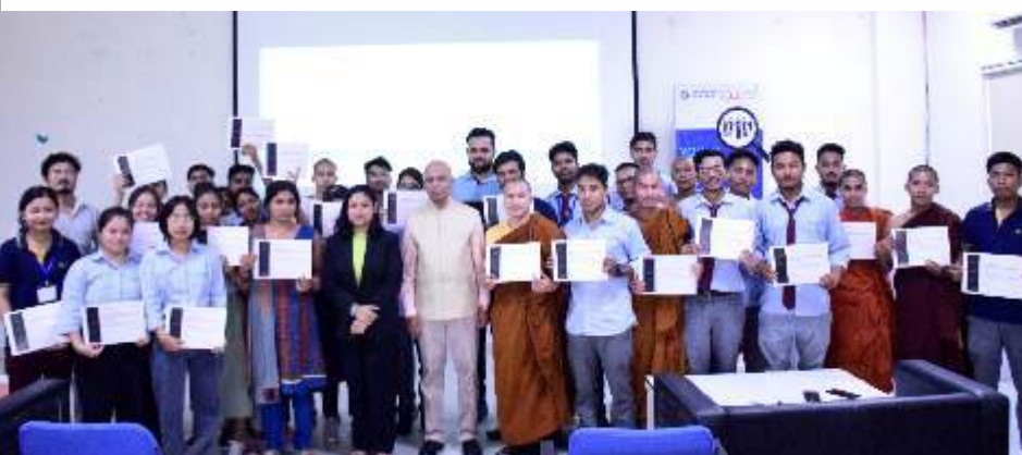
Youth Employment Programme