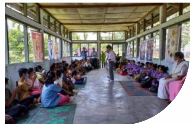
World No Tobacco Day