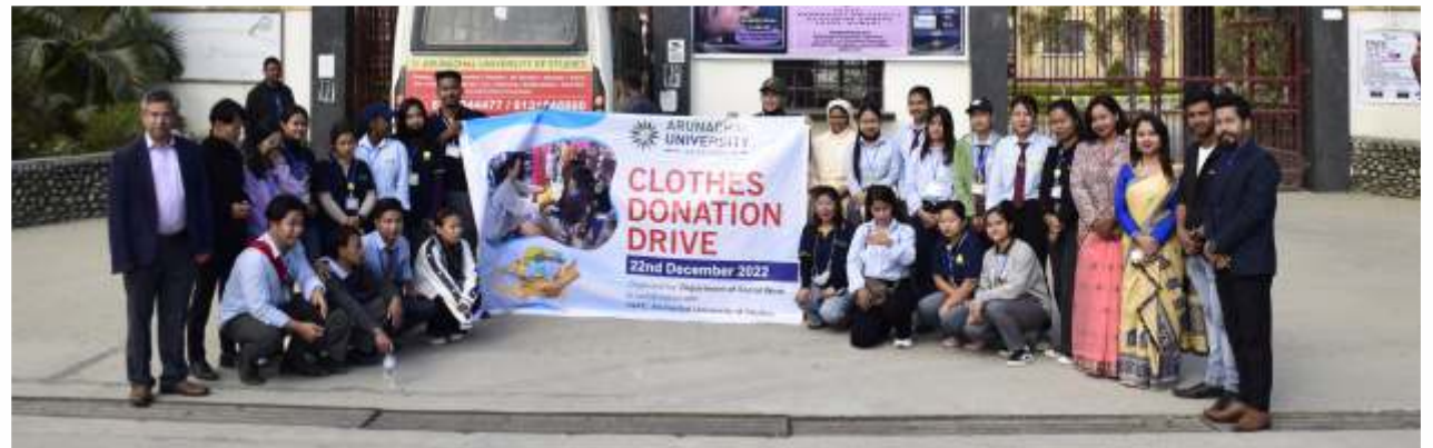
Clothes Donation Drive