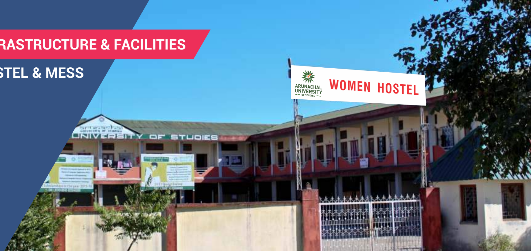
New Girls Hostel - Inside Campus