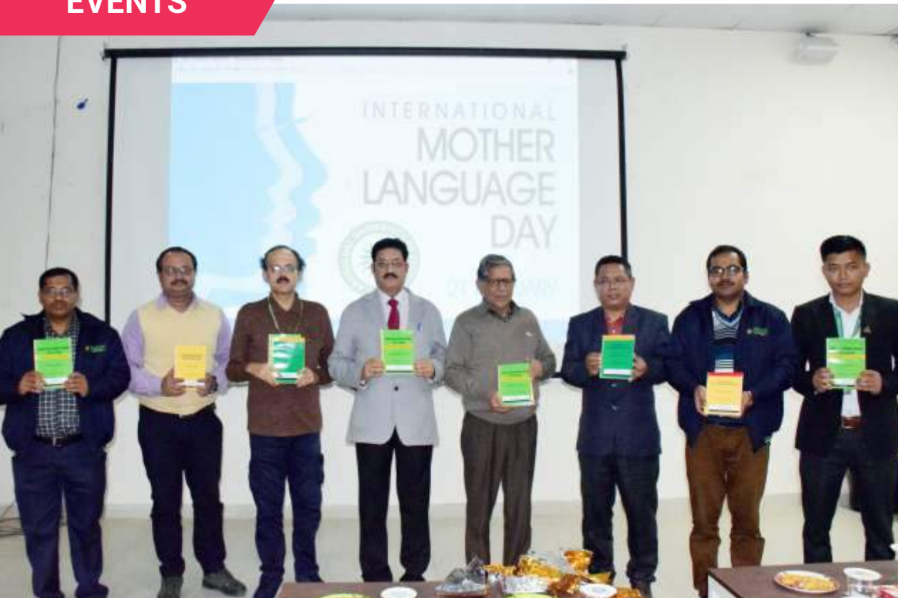
Internation Mother Language day