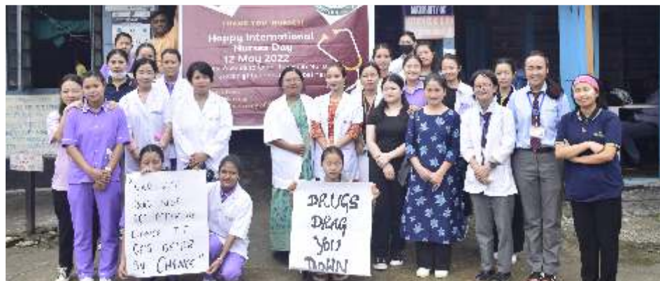
International Nurses Day