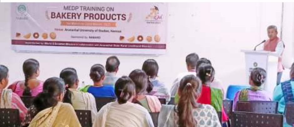
MEDP TRAINING ON BAKERY PRODUCTS