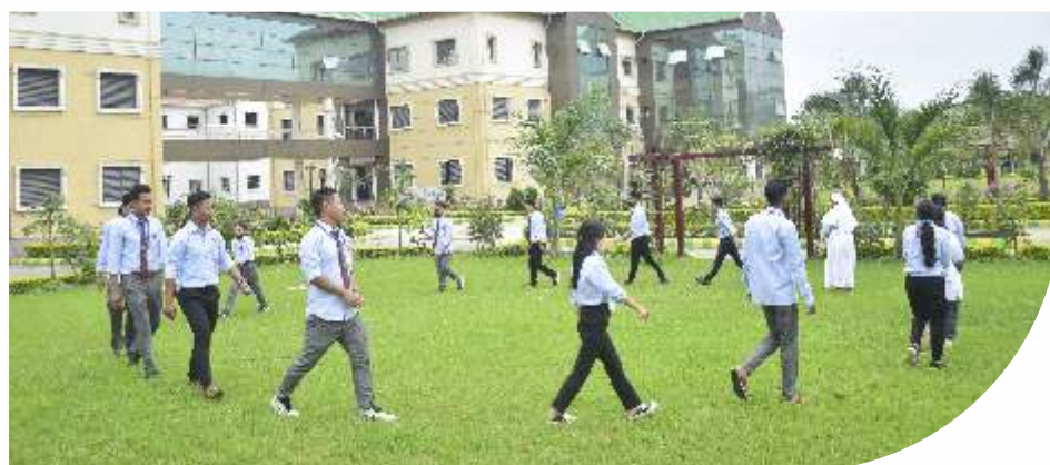
Drama Program by Social Work Department