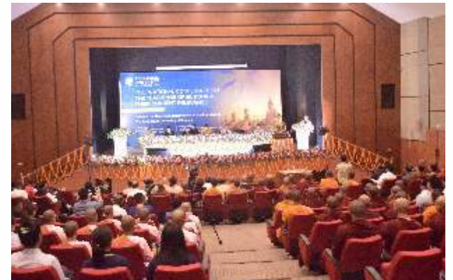
International Conference on THE TEACHINGS OF BUDDHA AND THEIR CURRENT RELEVANCE