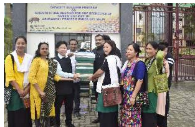
Capacity Building Program on Scientific Bee Keeping For SHG Beekeeper of Namsai District of Arunachal Pradesh Under Day NRLM