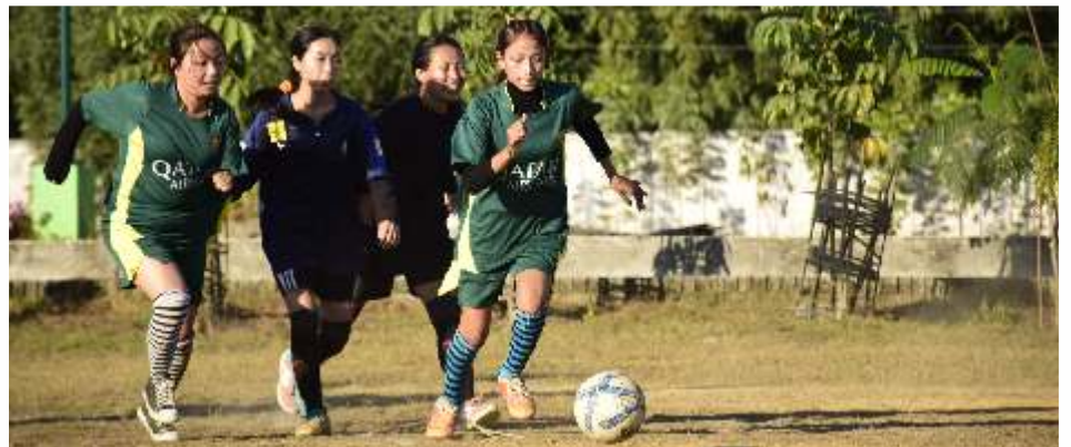
2nd Edition Inter department Football Championship